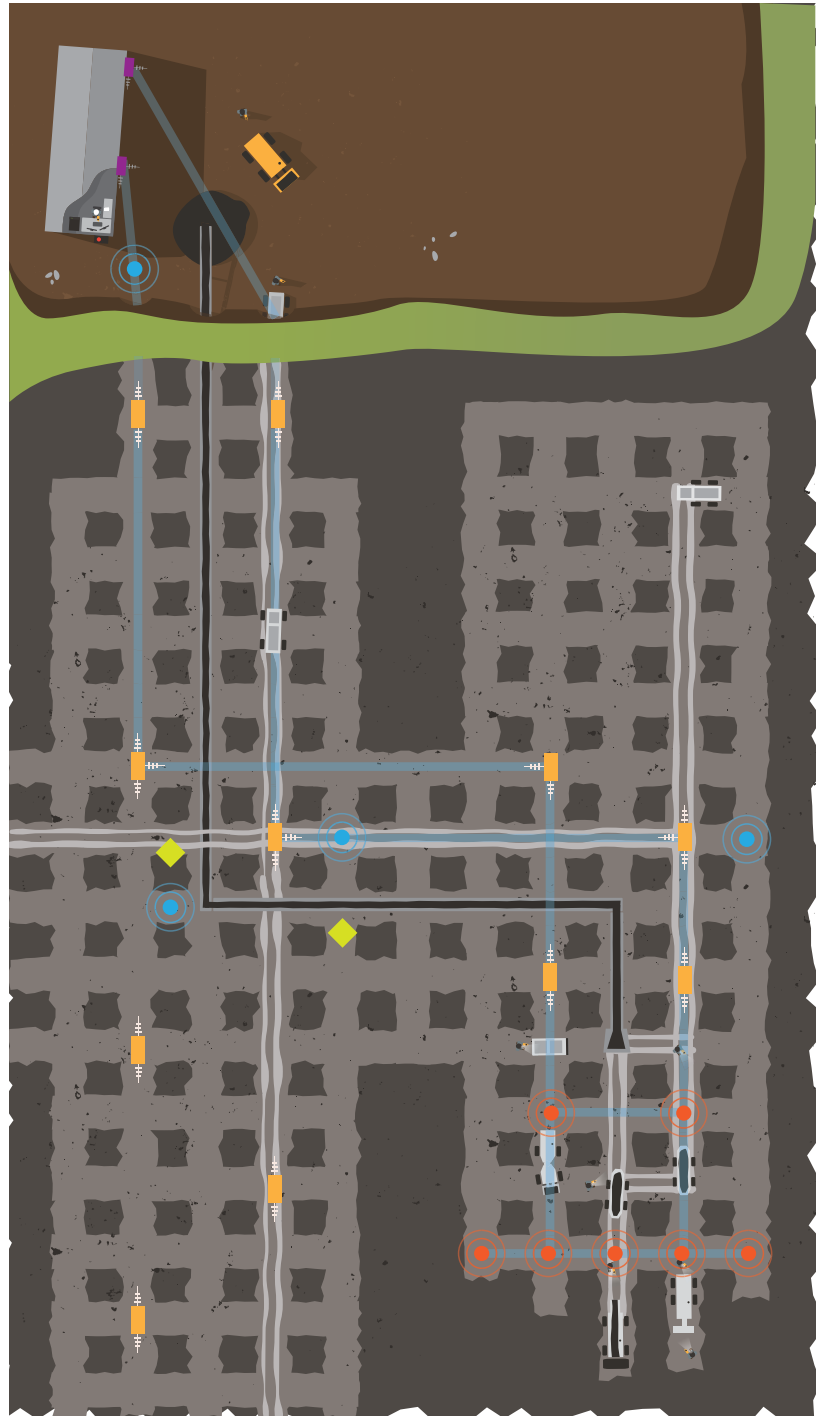
Close-up of working sections on reverse side.